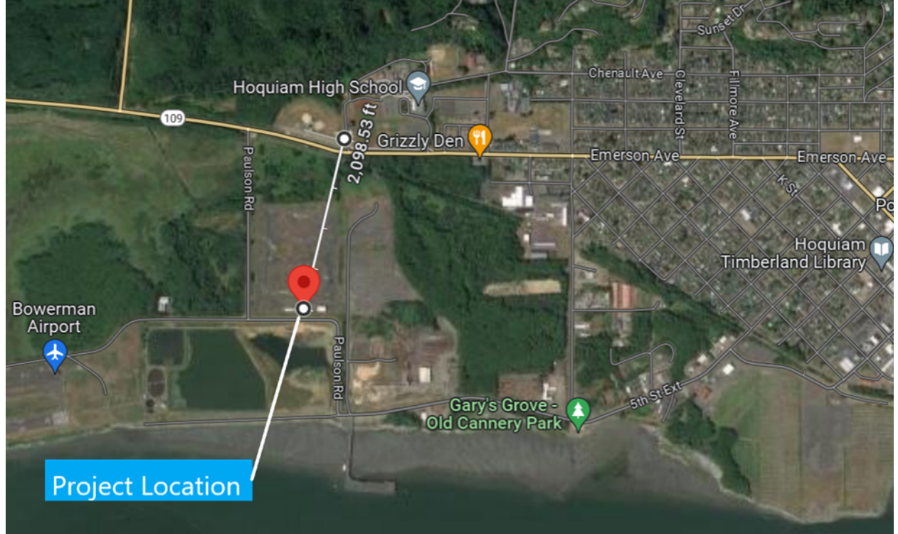
Figure 1: Proposed Location

The proposed wood pellet manufacturing facility will be located on an approximately 60-acre parcel in the city of Hoquiam, Washington. The facility is designed to produce, store, and export up to 440,800 short tons per year (TPY) of wood pellets and is intended to operate at least 8,000 hours per year. The proposed location is adjacent to the Willis Enterprises Moon Island Chip Mill (Willis Enterprises) and near Terminal 3 at the Port of Grays Harbor.